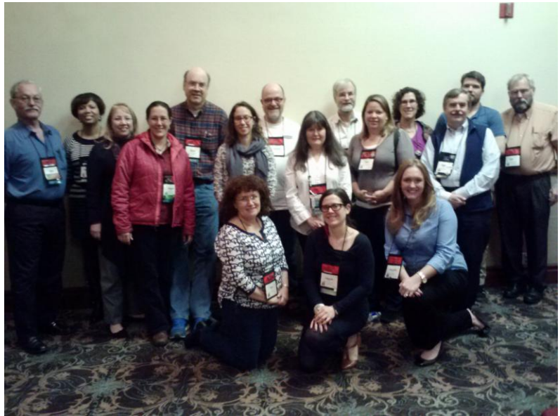
Region 2 Members at the recent National Workshop

State Rep for Delaware (keeps board in the loop about state calendar items, training, and recruits state members)